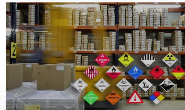
DANGEROUS GOODS HANDLING